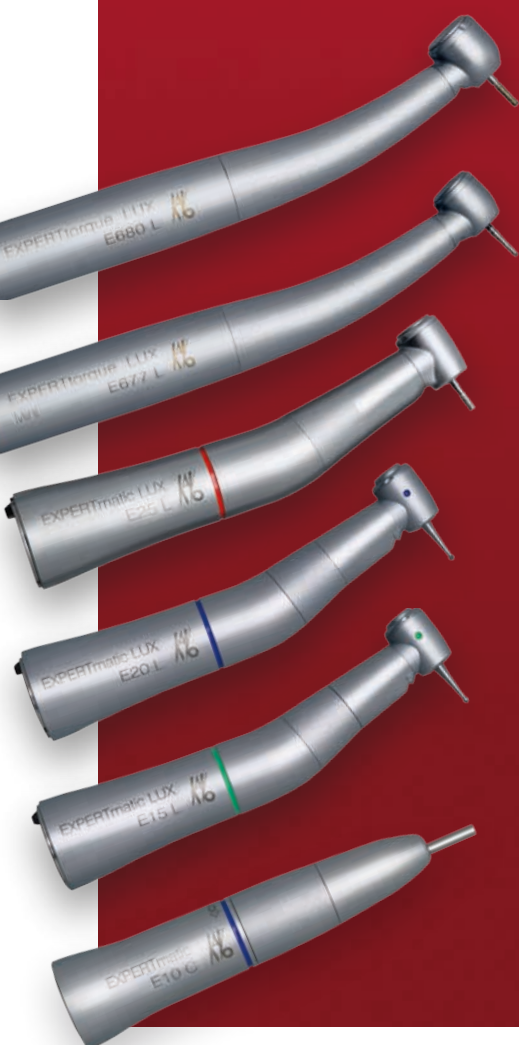
KaVo EXPERTtorque E680 L