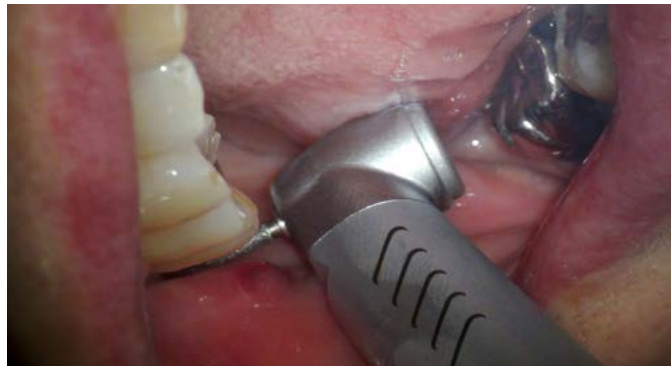
Treatment with M05L mini