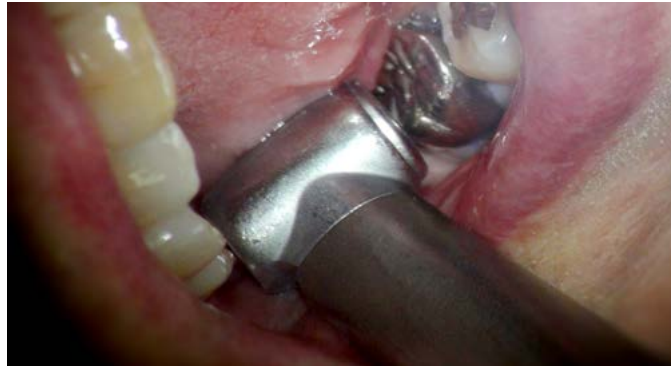
Treatment with 25LP