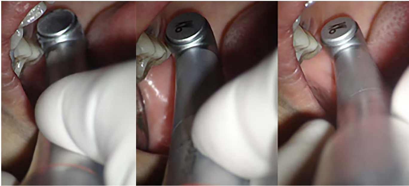
From the left: 25LP, M25L, and M05L mini.

Preparation is a procedure to crown restoration treatment such as caries removal, cavity preparation, and abutment preparation, and it is no exaggeration to say that preparation skills determine the success or failure of the dental treatment. When incorporating new concepts and equipment, such as the concept of MI (Minimal Intervention) or CAD/CAM, preparation is a step that tests the skills of dentists in any age. Therefore, it is essential that preparations planned by the dentist be supported by high-quality cutting instruments.