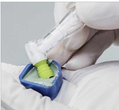
Special internal fins for easy pickup and targeted application of paste.