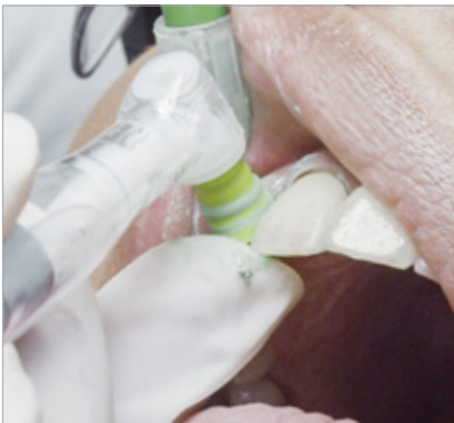
Nubs on the outside reduce splattering of the paste and polish the interdental space at the same time.