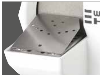
HSS-88 with inclined support, removable