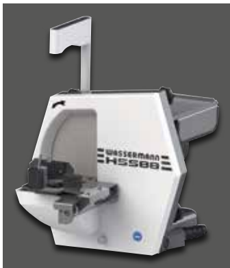
Extendable by orthodontic model table and/or laser light guide for 3 D trimming, ideal for orthodontics (the orthodontic model table can be delivered also in Swiss and EOS version)