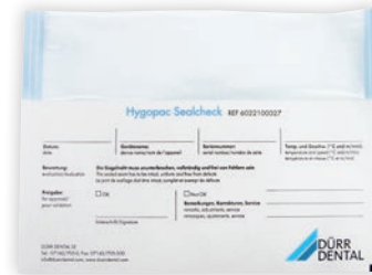
Hygopac Sealcheck, daily seam sealing test

The Hygopac View is the new generation of the Hygopac Plus rotary sealing device.