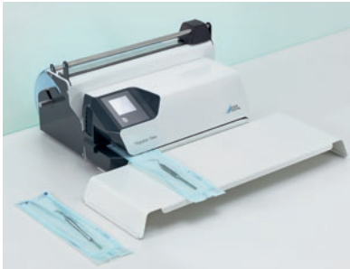
Instrument table and table-top Hygofol Station

The accessories and packaging film in the Hygopac System make your processes a breeze. The daily Hygopac seam sealing test allows you to check seam sealing quality at a glance every day – creating added security and reassurance.